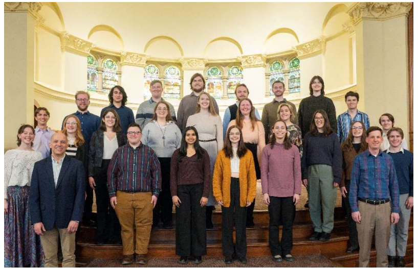
Doesn't this look like a delightful bunch of people to spend ten days with?