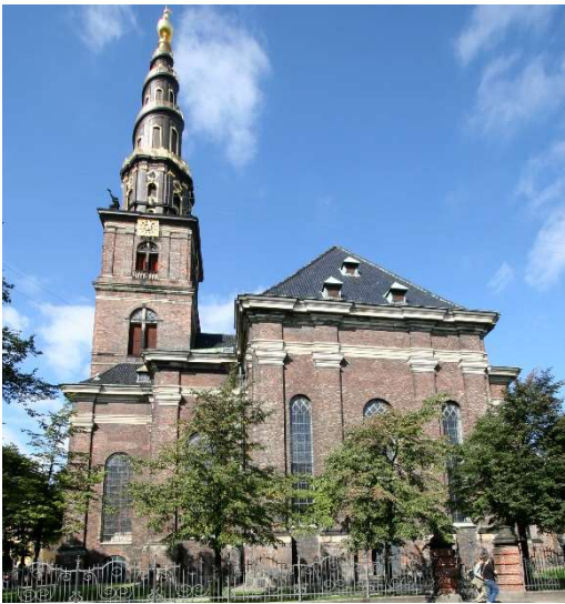
The Church of Our Savior in Copenhagen, one of the venues at which the choir will perform.