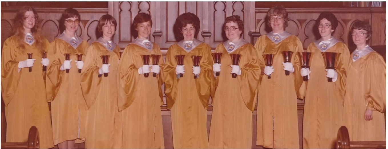
The Liberty Bells circa 1980, when gold was in vogue. How many of these smiling faces do you recognize?

Did you know that handbell ringing has been a component of First Presbyterian's music ministry since the 1970s? Over the years our Liberty Bell Choir has not only rung in worship, but in various settings outside our walls as well, such as care homes and the Garden Club's "Trees of Christmas". The skill and dedication required to put such complicated pieces together is evident each time they ring. Some of our current ringers have been active since before I was born, and I'm immensely grateful for the countless hours they've put into rehearsing week by week.