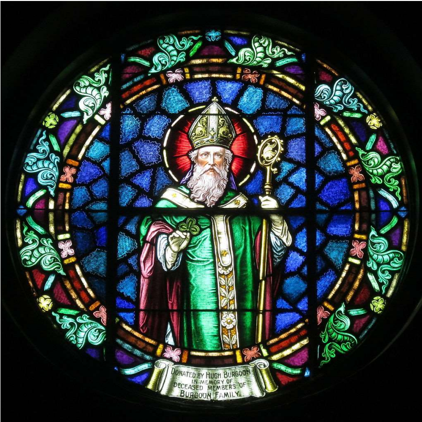
Saint Patrick, Saint Patrick Catholic Church, Junction City, Ohio Stained glass window

Fifth Sunday in Lent Sunday, March 17, 2024 • 8:30 & 11:00 AM